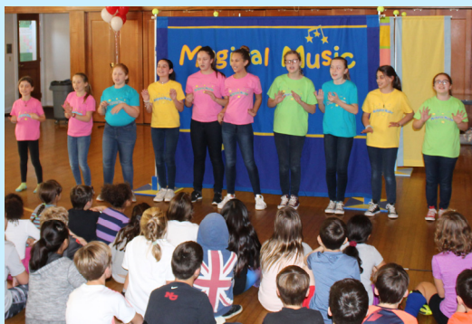
Performing the show for Eagle Hill Southport 's students. Other schools included Giant Steps (Southport) and Children's Country School (Katonah).

Magical Music's touring show, A Day in the Life of a Child: Musical Revue , inspired by our album with the same name, touched the lives of numerous children over the last year. Focusing on the events in the day in the life of a child, this album uses the power of music to teach children basic, social, emotional, and physical skills. While written for children with autism and other special needs, the music is a delight for all. This year one school asked us to perform the show to TEACH teachers about how children with special needs feel! Contact us for booking recommendations and requests.